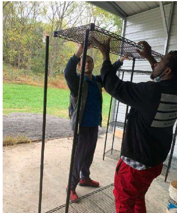
Participants build shelves for the new storage shed