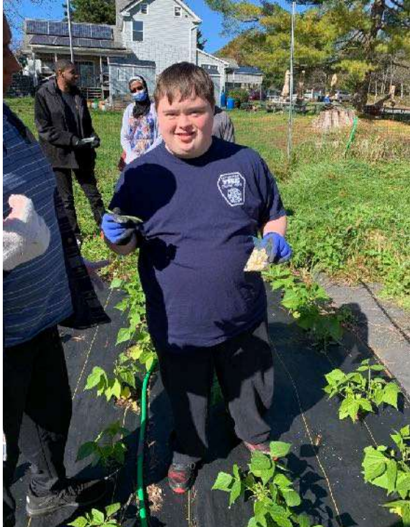
OASIS Farms grows "Happiness"

While learning and developing vocational and life skills is a main focus at OASIS Farms, the socialization factor is essential to the community's success. Just look at these happy faces!