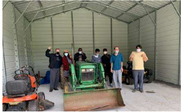
Participants check out farm equipment in new building