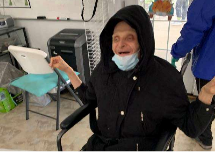
A sense of belonging