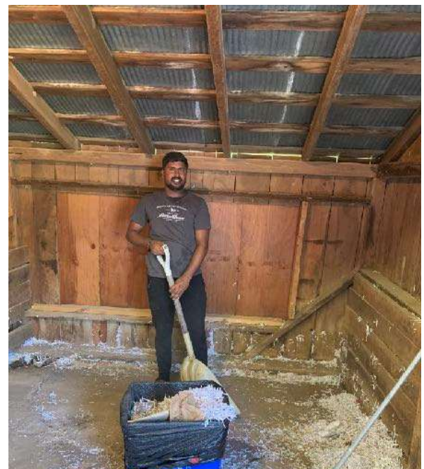
Our friends from SBA Temple have given us countless hours of service