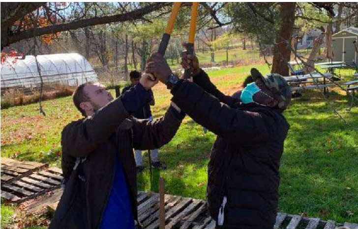
A place where all can succeed