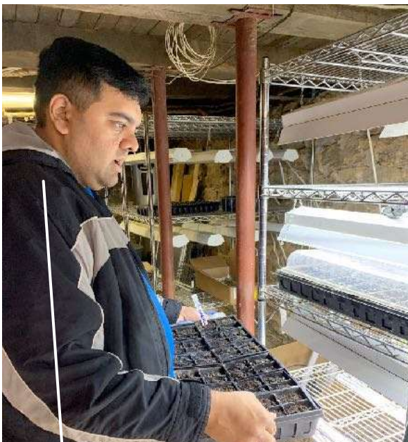
Farm participant works in the grow cellar

A year of new beginnings, new friends, and new ideas.