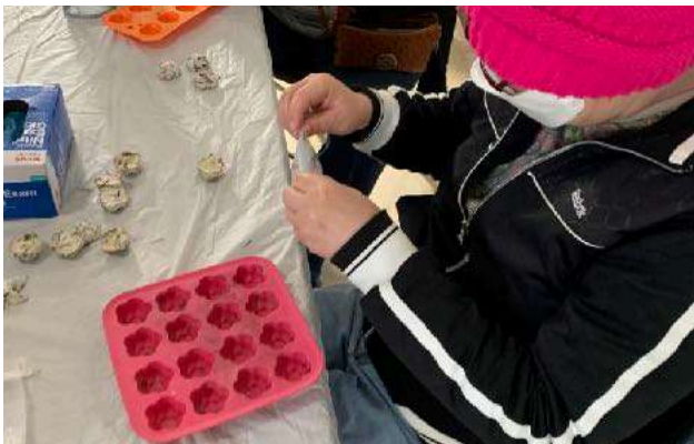
A participant makes seed bombs