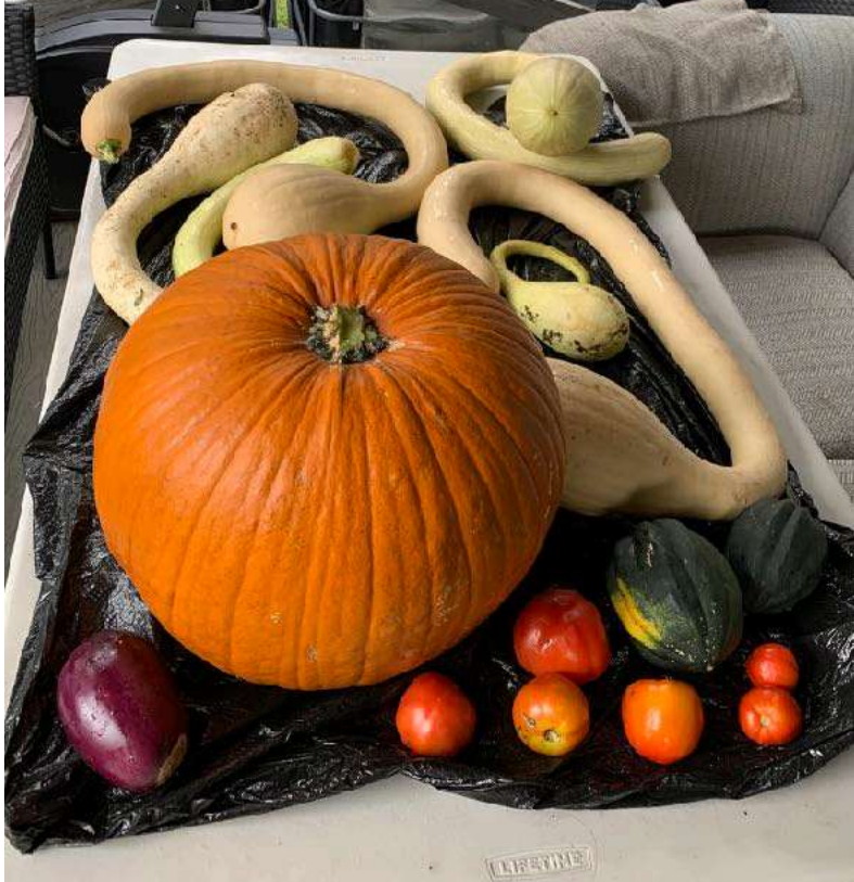
Check out those squash