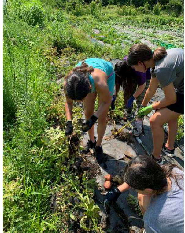
Girl Scout volunteers work the fields