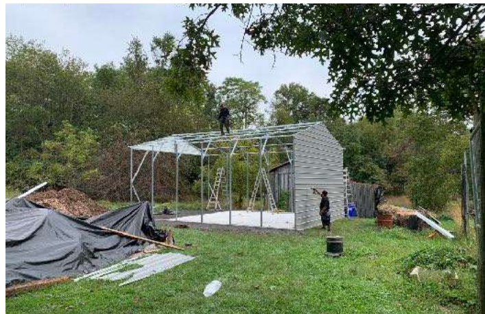
A new equipment shed being built