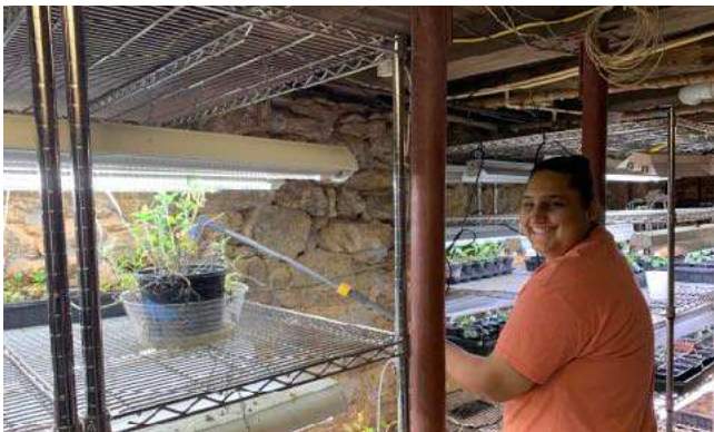
Nurturing seedling plants is essential