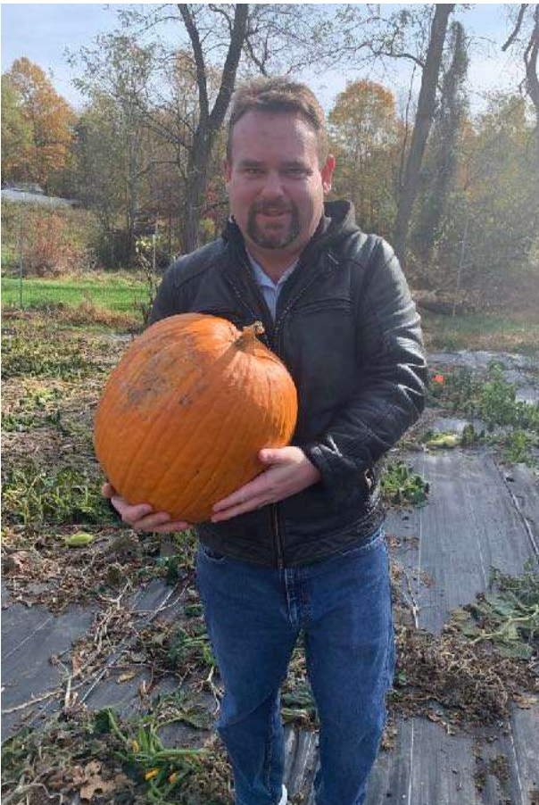
Our pumpkin patch was amazing

Hard work pays off! Our 2021 harvest has been one of the best to date. All of the workers, participants and volunteers at OASIS Farms can take pride in the beautiful harvest of late summer and fall.