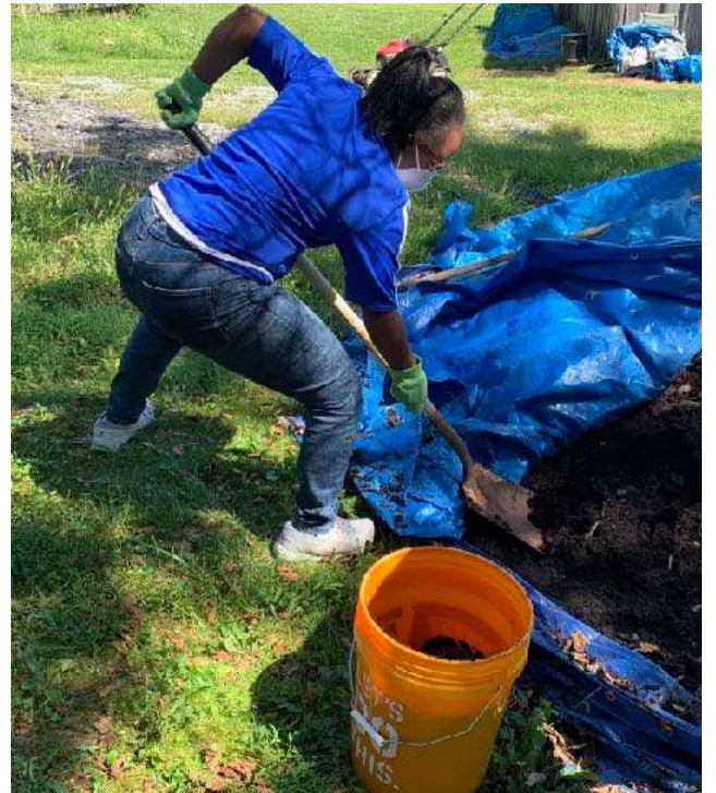
You Go, Girl!