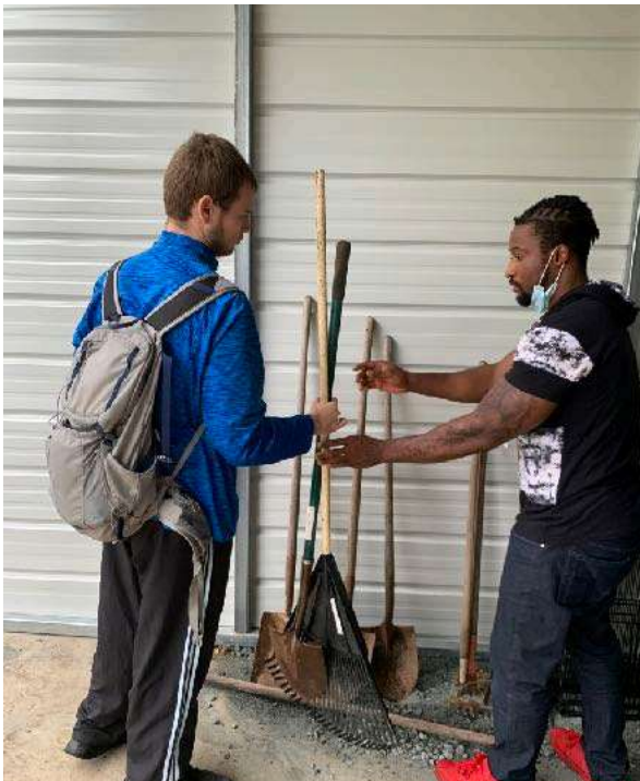
A participant learns about garden tools

are much appreciated as more and more adult service agencies reopen and sign on as participants at OASIS Farms. As Montgomery County moves toward post pandemic, OASIS has welcomed four additional participating partner agencies and three independent participants.