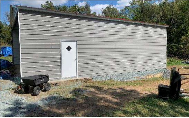
A new barn for OASIS Farms