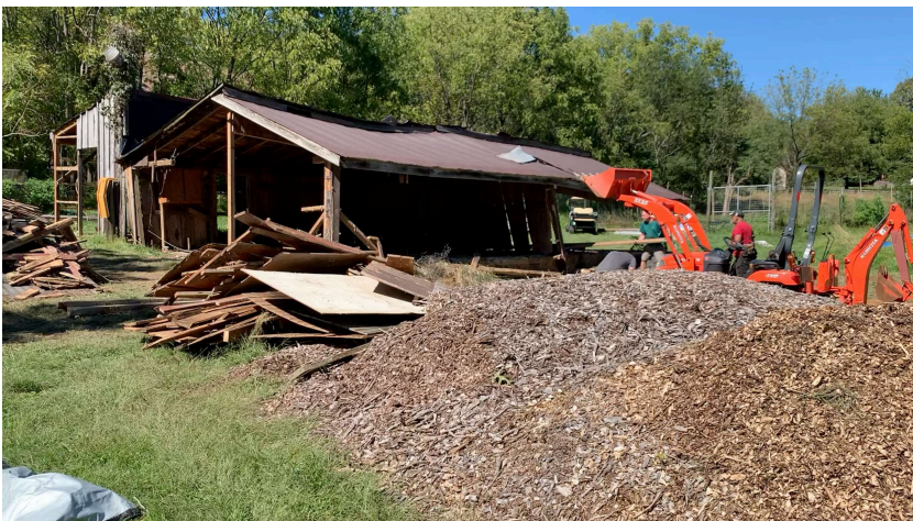
Left: Construction workers bring down the old barn.