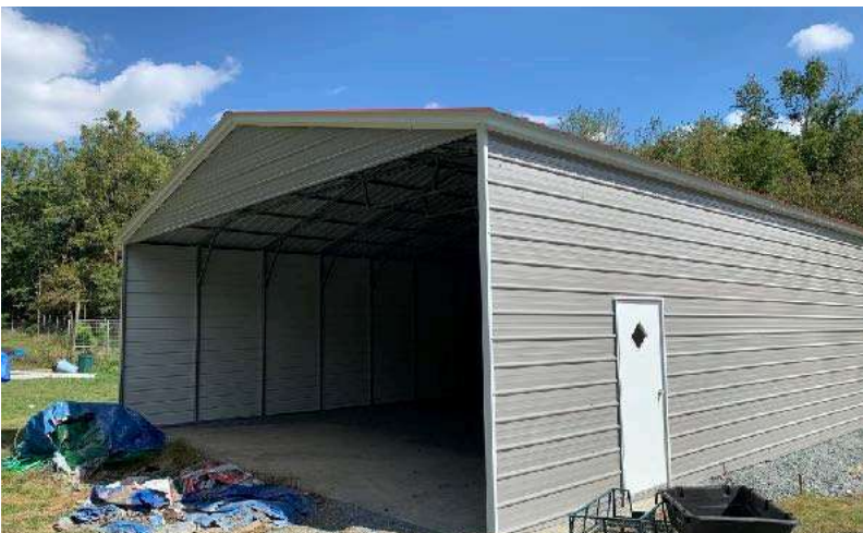
The large, unobstructed spaces provide safe and efficient learning and storage areas