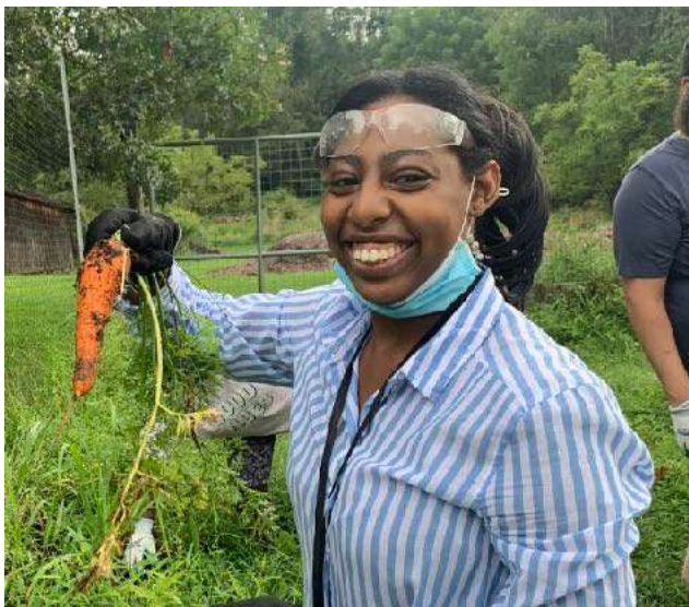
The best part is harvesting