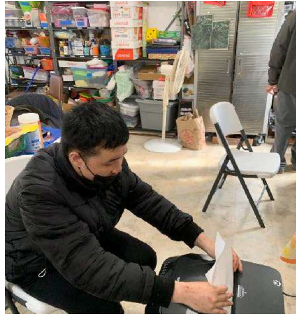
Many participants love to shred

Document shredding and agricultural endeavors fill most days at OASIS Farms; but many textile crafts have been added and are enjoyed by the participants.