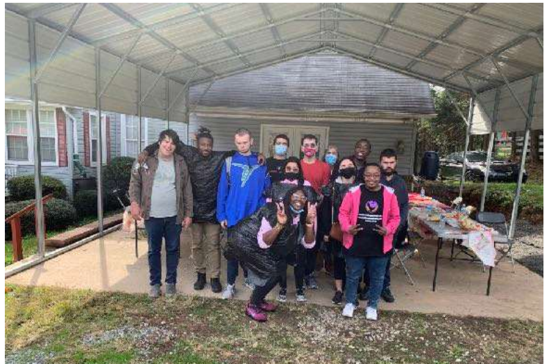
OASIS participants show off the new garage expansion

By early Spring plans for replacing the old, badly damaged out buildings were well on its way to becoming a reality. With the help of county grants and a Maryland State Capital Bond, we were able to expand the renovated garage by adding a carport to protect the attached open patio. A cement pad was poured to accommodate a large equipment shed replacing the old one destroyed in a storm. Our largest barn was demolished making way for a brand new steel structure that will hold farm supplies and equipment with plenty of room left over to conduct instructional workshops on a multitude of farming skills.